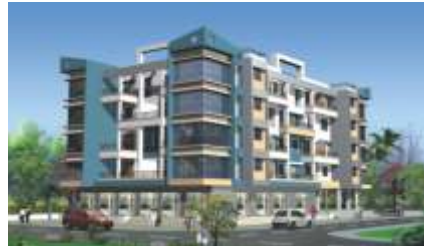
Vishwa Neel At Kharadi,Pune