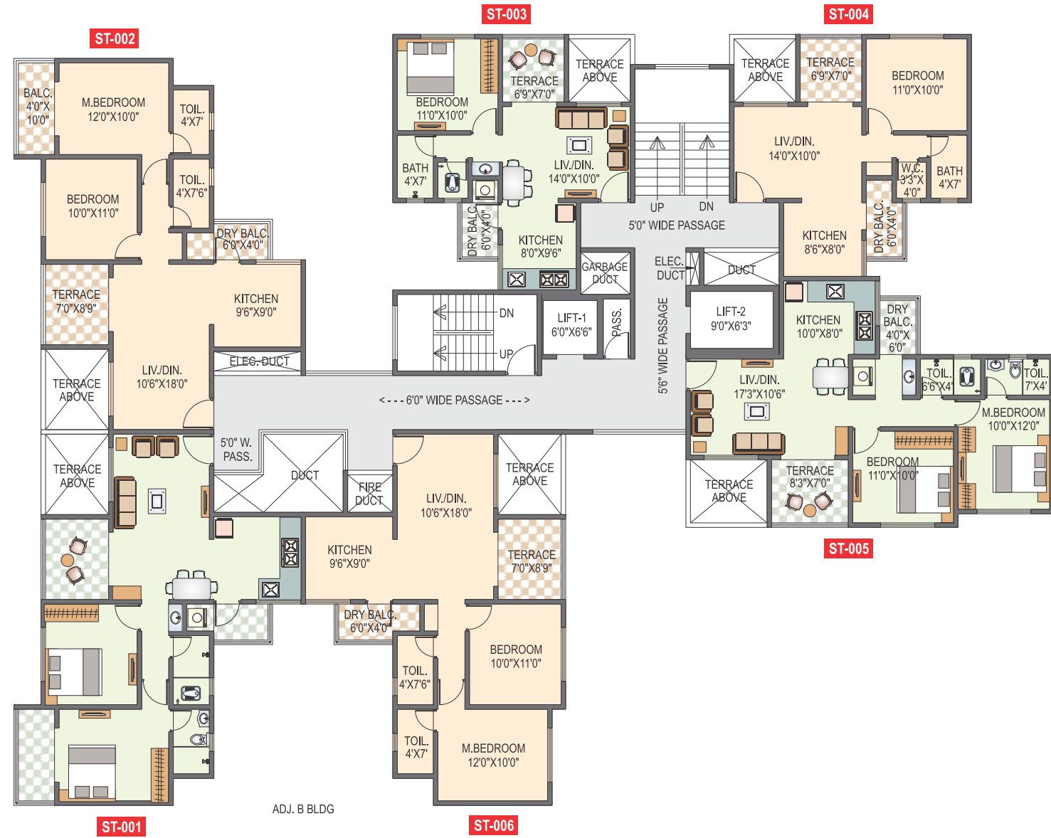
AREA STATEMENT IN SQ.FT.