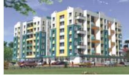
Vishal Srushti Residency At Vadgaon Sheri,Pune