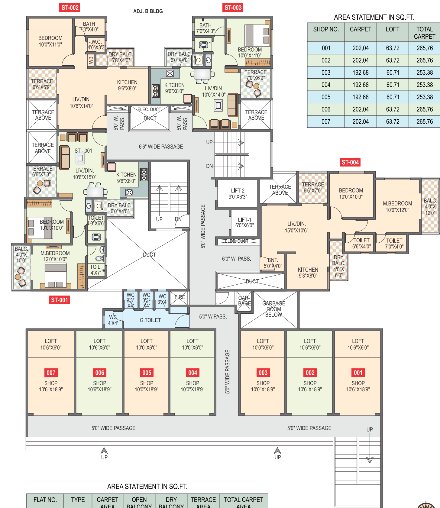
AREA STATEMENT IN SQ.FT.