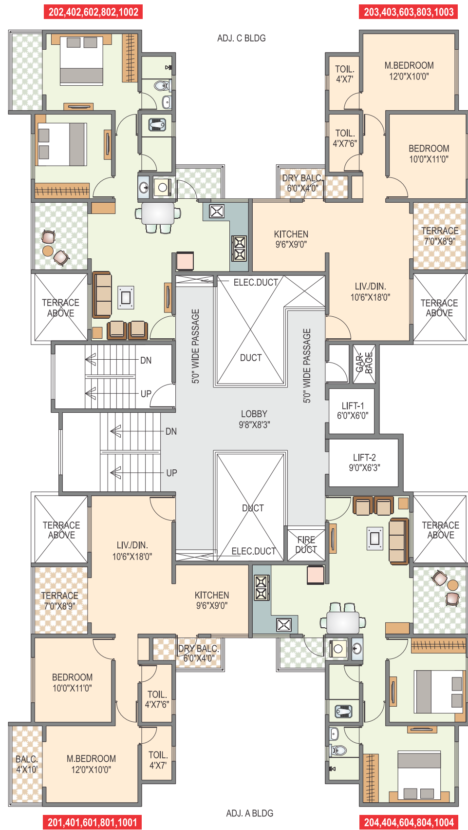
AREA STATEMENT IN SQ.FT.