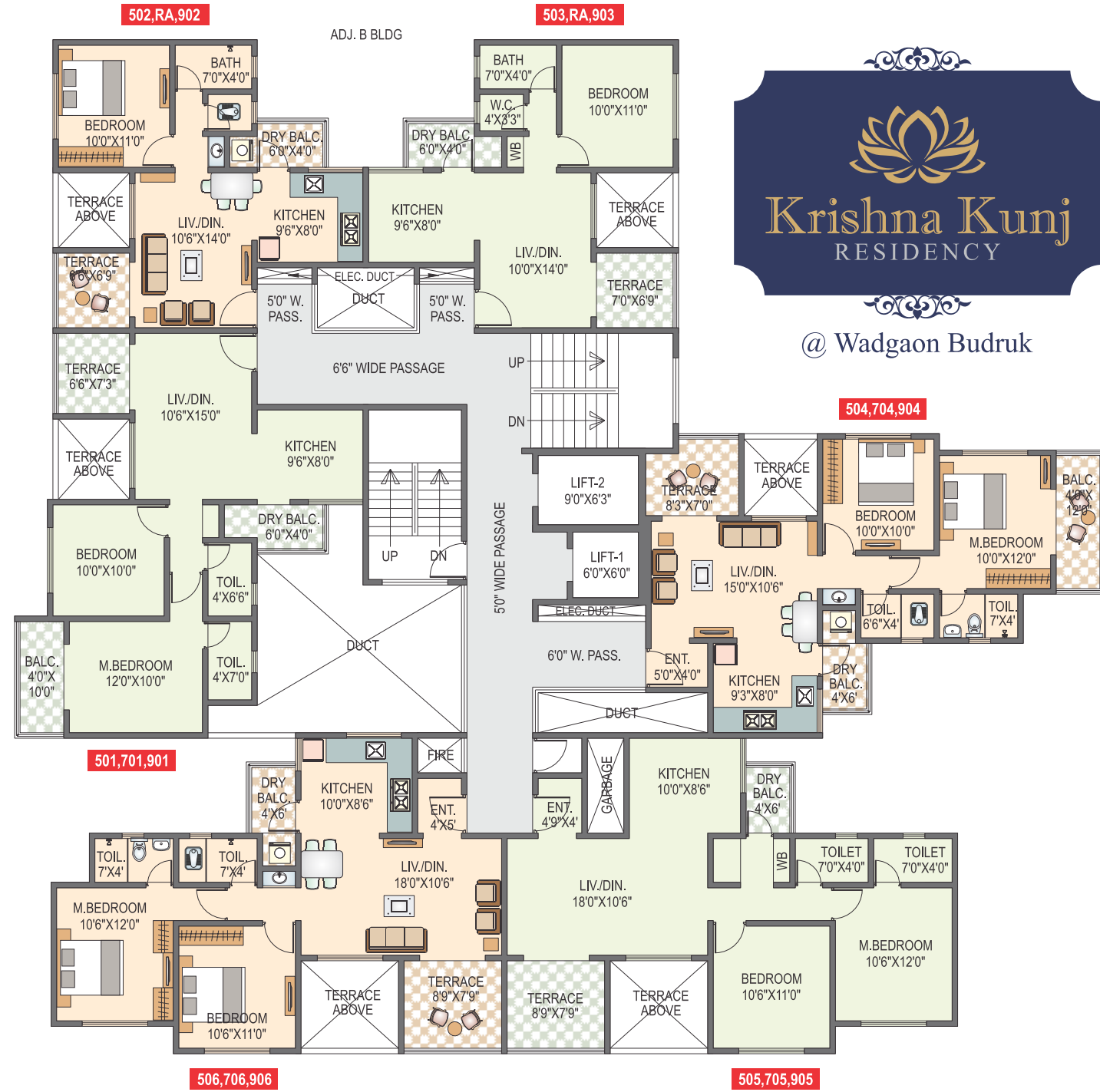
AREA STATEMENT IN SQ.FT.