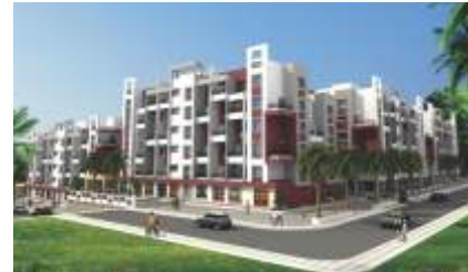
Vishwajeet Residency At Kharadi,Pune