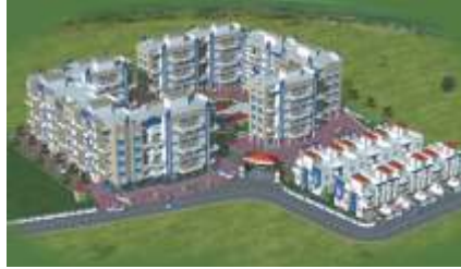
Vishaldeep Residency At Kharadi,Pune

A CREATION BY: S.G.LANKE CONSTRUCTION CO.