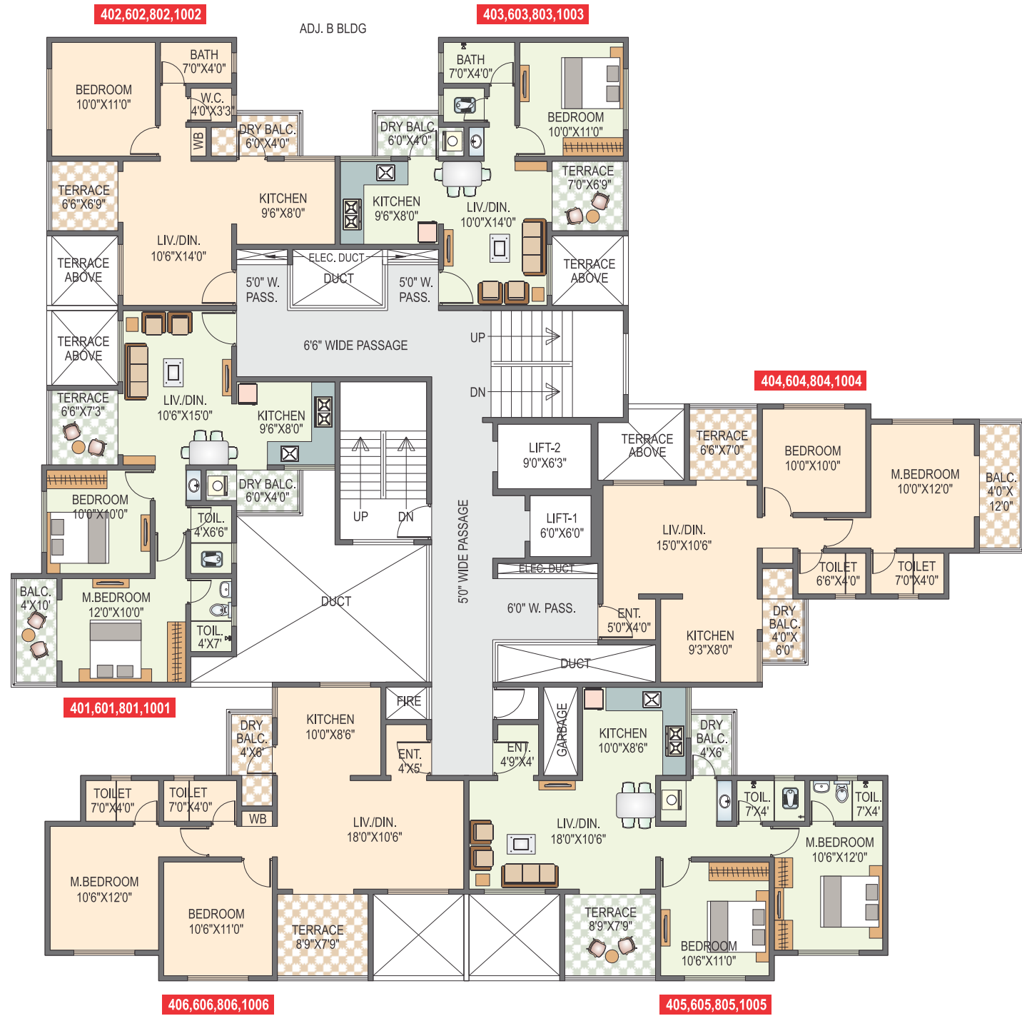
AREA STATEMENT IN SQ.FT.