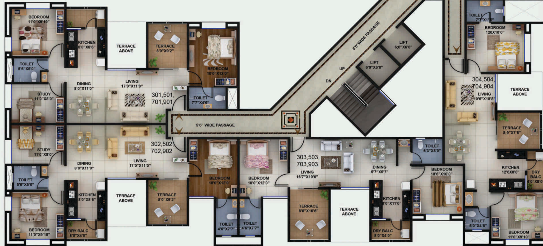
THIRD, FIFTH, SEVENTH AND NINTH FLOOR PLAN