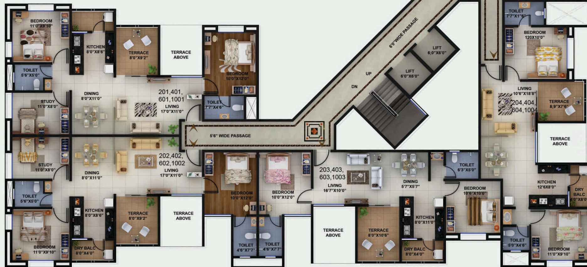
SECOND FOURTH SIXTH AND TENTH FLOOR PLAN